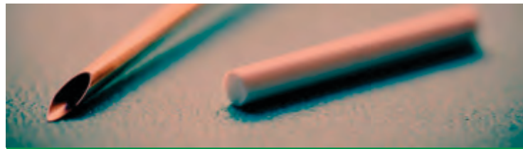
ZVINOOGONA KUITIKA NEKUSHANDISA MAIMPLANTS

Vanhukadzi vazhinji havasangani nematambudziko mukushandisa malimplants, kune vanenge vasangana nawo vanokurudzirwa kuenda pakiriniki iri pedyo navo.